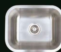
Charleston T-8206 20" x 16" x 8" Accessories: Strainer