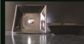
T-17S Black 16-3/8" x 16-3/8" 4-3/4" Pop Up Drain Included