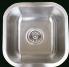
Durham T-8201 16" x 16" x 8" Accessories: Strainer

Premium 16, 18 and 20 Gauge. 304 Surgical Stainless Steel 18/10 Chromium/Nickel Content Padded and Sprayed for Sound Absorption and Insulation All Double Bowls Reinforced for a Sag Proof Deck