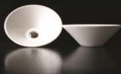
T-17R Bone 16-5/8" x 5-7/8" Pop Up Drain Included