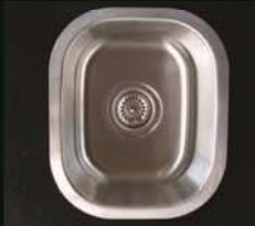
Lenox T-8207 15-1/8" x 12-3/4" x 7" Accessories: Strainer