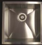
Cahaba TH-1206 17" x 18" x 10" Accessories: Strainer