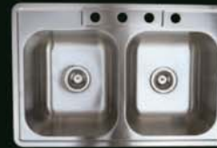
Montrose T-7201 33" x 22" x 8" Accessories: Grids, Strainer