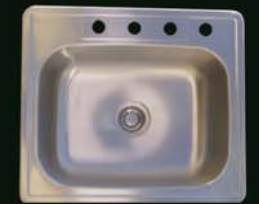
Camden T-7203 25" x 22" x 8" Accessories: Strainer