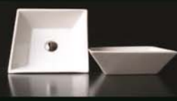
T-17S Bone 16-3/8" x 16-3/8" 4-3/4" Pop Up Drain Included