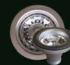
Brushed Strainer T-SS 3-1/2"