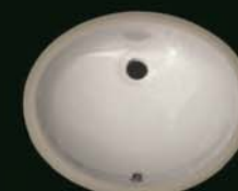
T-1512 White OD: 17" x 14" ID: 15" x 12"