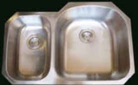
Lexington R T-9205 R 31-1/4" x 20-1/2" x 9" 7/7" Accessories: Grids, Strainer