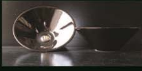
T-17R Black 16-5/8" x 5-7/8" Pop Up Drain Included