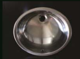
TS-1714 OD: 19-1/8" x 16-1/8" ID: 17" x 14"