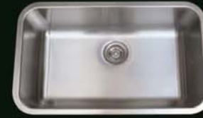
Manhattan T-9204 30-1/8" x 18" x 10" Accessories: Grids, Strainer