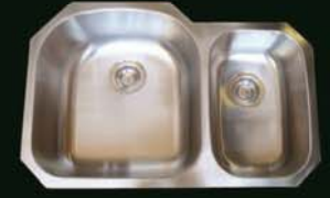
Lexington T-9205 31-1/4" x 20-1/2" x 9" 7/7" Accessories: Grids, Strainer