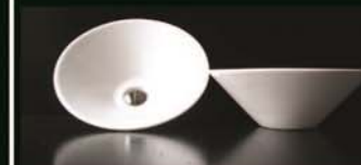
T-17R White 16-5/8" x 5-7/8" Pop Up Drain Included