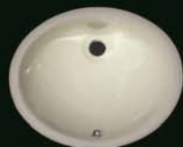
T-1512 Bone OD: 17" x 14" ID: 15" x 12"