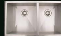
Sonoma TH-1202 32" x 19" x 10" 10/10" Accessories: Strainer