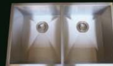
Oxmoor TH-1201 32" x 19" x 10" 10/10" Accessories: Strainer