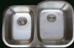
Malibu R T-9202R 31-5/8" x 20 1/2" x 9" 7/8" Accessories: Grids, Strainer