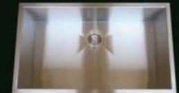
Kenner TH-1202 32" x 19" x 10" Accessories: Strainer