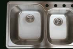
Claymont T-7202 33" x 22" x 9" 7/8" Accessories: Grids, Strainer