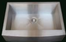
Hampton TH-1203 30" x 20" x 10" Accessories: Strainer