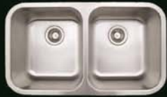
Hammond T-9206 31" x 18" x 10" 10/10" Accessories: Strainer