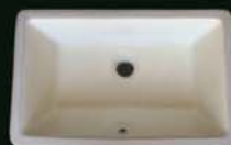
T-1912 Bone OD: 21" x 14" ID: 19" x 12"