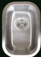
Jackson T-8202 12-1/2" x 18" x 7" Accessories: Strainer