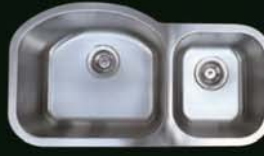
Birmingham T-9203 31-1/4" x 17" x 9" 7/7" Accessories: Strainer