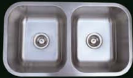
Denver T-9201 31-1/4" x 18" x 9" Accessories: Grids, Strainer

Premium 16, 18 and 20 Gauge. 304 Surgical Stainless Steel 18/10 Chromium/Nickel Content Padded and Sprayed for Sound Absorption and Insulation All Double Bowls Reinforced for a Sag Proof Deck