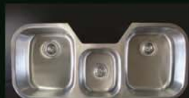
Bristol T-9207 46-1/2" x 20-5/8" x 9" 7/7" 9/9" Accessories: Strainer