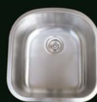
San Antonio T-8205 19-3/4" x 20-1/2" x 9" Accessories: Strainer