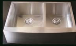
Florence TH-1205 33" x 20" x 10" 10/10" Accessories: Strainer