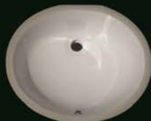
TS-1714 White OD: 19-1/8" x 16-1/8" ID: 17" x 14"