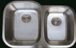
Malibu T-9202 31-5/8" x 20 1/2" x 9" 7/8" Accessories: Grids, Strainer