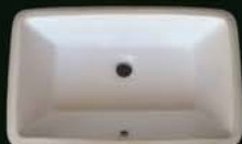
T-1912 White OD: 21" x 14"