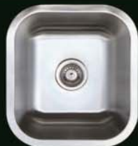
Panama T-8203 18" x 16" x 8" Accessories: Strainer