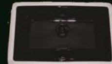
T-1912 Black OD: 21" x 14" ID: 19" x 12"