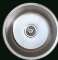
Benton T-8204 17-3/4" x 7" Accessories: Strainer