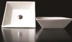
T-17S White 16-3/8" x 16-3/8" 4-3/4" Pop Up Drain Included