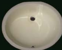
TS-1714 Bone OD: 19-1/8" x 16-1/8" ID: 17" x 14"